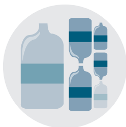
PET y HDPE