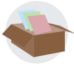
Cartón y papel