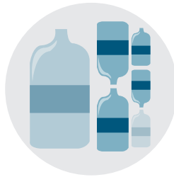
PET y HDPE